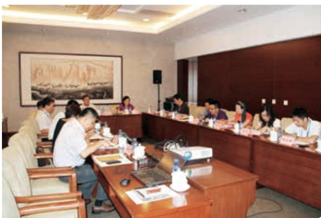
First preparatory meeting for IKCEST International Symposium 2015 held in Beijing