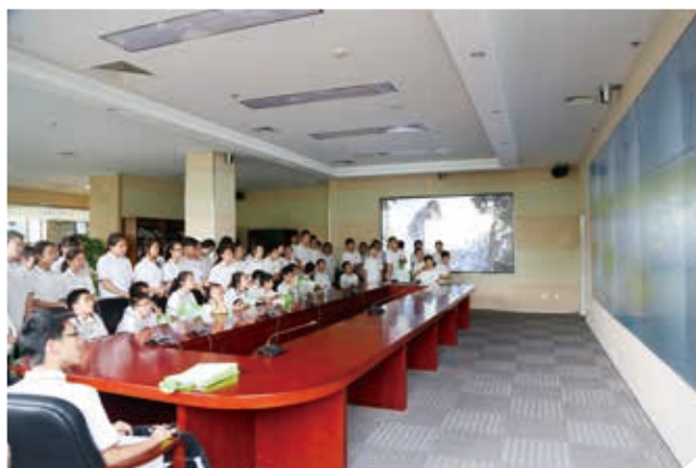
"Teenagers Go into the Chinese Academy of Engineering" campaign — visiting IKCEST Headquarter