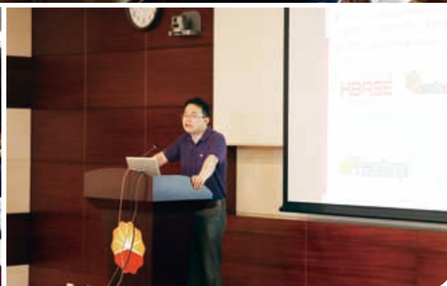
China-Ukraine Workshop on Resources Classification: Status, Mapping and Application held in Beijing