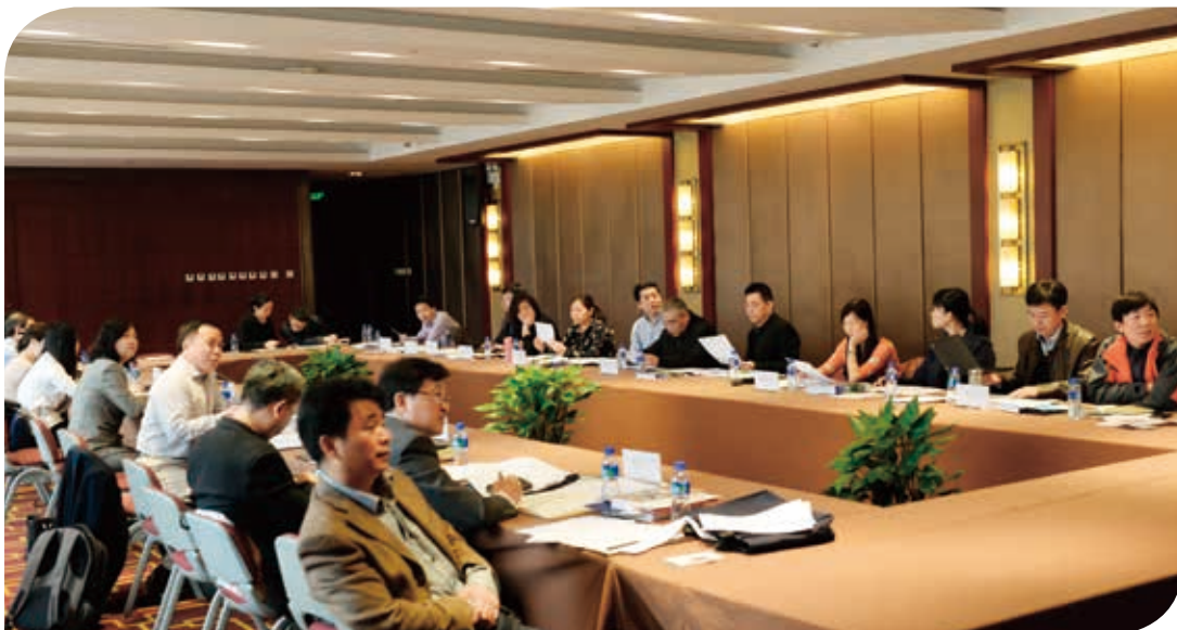
IKCEST attended inaugural and first meeting of the Union of UNESCO Category 2 Centres in China

At the meeting, representatives of the International Knowledge Centre for Engineering Sciences and Technology (IKCEST) introduced the centre's major work, recent progress and work plan, and exchanged views with other representatives and officials of the National Commission on related matters.