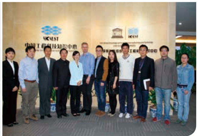
Programme specialists from UNESCO Beijing office inspected IKCEST