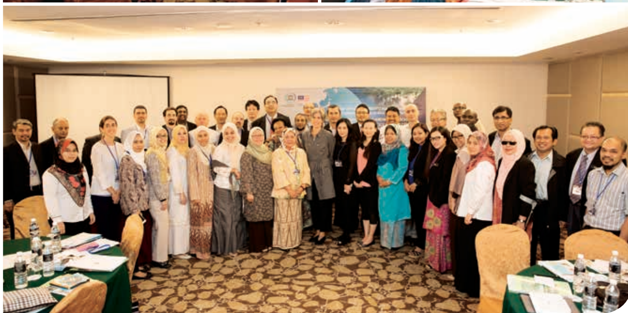
IKCEST attended Regional Workshop of UNESCO Natural Sciences Related Centres and Chairs in Asia and the Pacific