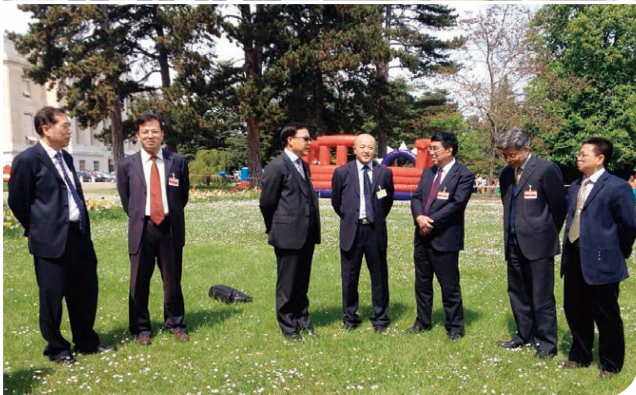
Delegation Attended the 6th Session of UNECE Expert Group on Resource Classification in Geneva, Switzerland